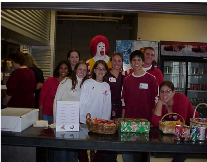
S.Y.A.C. Members helping at a Ronald McDonald House fundraiser

I don't know what your destiny will be, but one thing I know: the only ones among you who will be really happy are those who have sought and found how to serve.