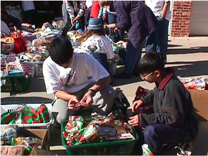
Students volunteering for Christmas is For Children